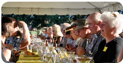
Guests enjoy great food and conversation during "Passion for Polson" celebration.

T he setting was straight out of Sunset Magazine: a long communal table for 110 set with colorful table linen and decorations under a tent for shade in a beautiful yard on a farm that has been in the same family for 101 years. Surrounded with pastures, hayfields, and views of Flathead Lake and the Mission Range, it was the perfect setting for La Vida Local (The Local Life), theme of the Greater Polson Community Foundation's (GPCF) third annual Passion for Polson Celebration.