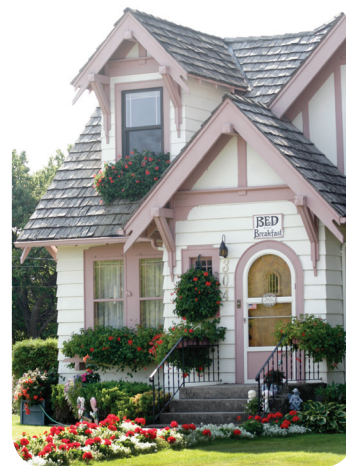
Hawthorne House B&B was named "Best Bloomin' Business."